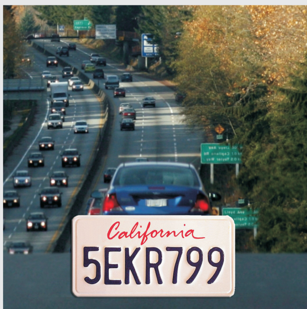
Enlarged using a Megapixel Camera