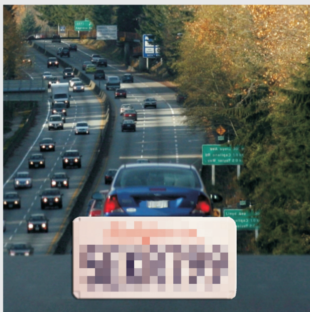
Enlarged using a Standard CCTV Camera

Visec® Surveillance is an IP Network / Digital video recorder that provides a complete solution to today's most demanding video surveillance requirements. Visec® integrates scalable megapixel surveillance technology as part of a total IP convergence model.